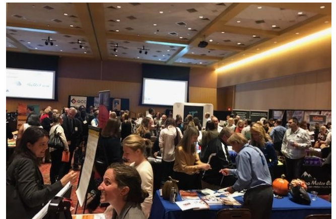
2018 Economic Summit Networking.