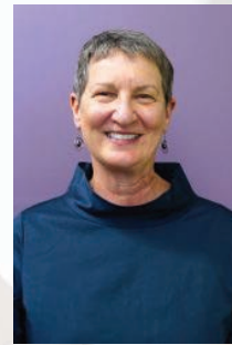
Barbara Noseworthy City Councilor, City of Durango